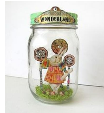
Alice In Wonderland